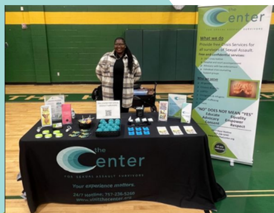
Bethel High School College and Career Fair