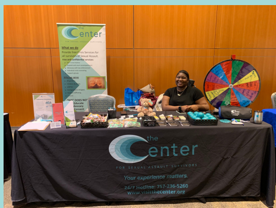
Hampton City Schools- Social Work Services Mental Health Fair