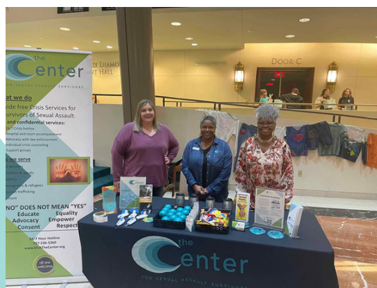
Christopher Newport University Annual Shadow Event