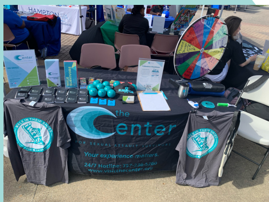
Virginia Peninsula Community College Health and Wellness Fair

Helping our community to be well informed is critical to our vision of a future free from violence. We work to accomplish this through providing FREE education & training as well as by participating in community events.